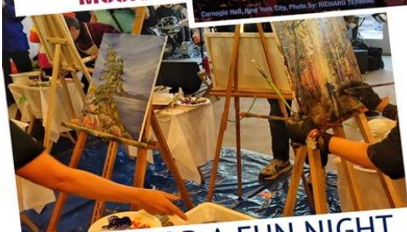
Carnegie Hall, New York City.