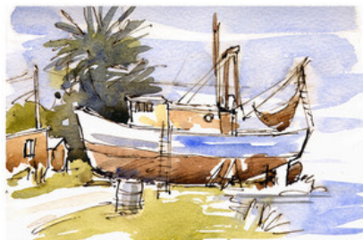
line & wash