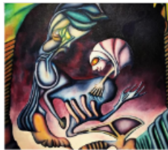
By: Jeff Bardeau

The "Into The Darkness" theme can mean different things to different artists. Let your imagination go as you depict the macabre, dark places, or dark meanings in drawings, paintings, mixed media, sculpture and photography. Let's fill the gallery as we anticipate Hallowe'en and our Masquerade Ball.